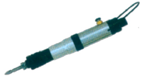
RY501 Torque Controlled Screw Driver