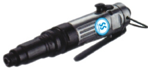
SS1161 Screw Driver