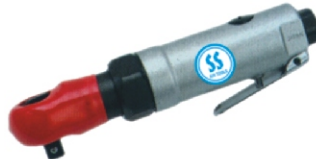
SS1205B 3/8" Ratchet Wrench