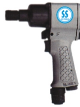
SS1365D Impact Driver