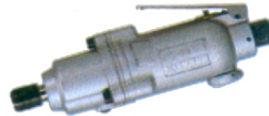
RY600 Impact Driver