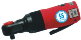
SS1107A 1/4" Ratchet Wrench