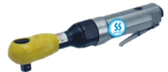
SS1325A 1/2" Ratchet Wrench