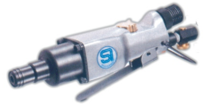
SS1370D Impact Driver