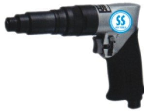
SS1166A Screw Driver