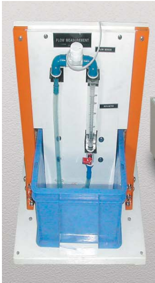
◀ Table Top Flow Setup